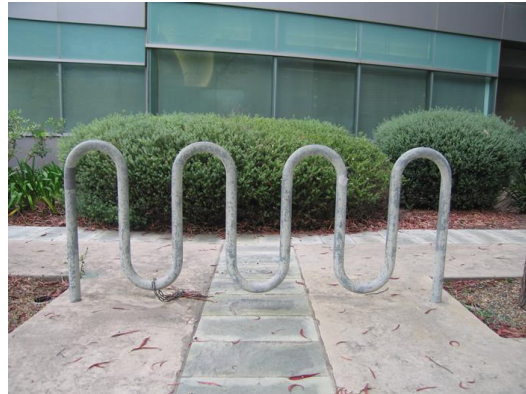
Figure 2: Example of Wave Rack