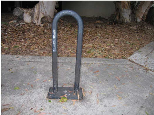
Figure 1: Example of Inverted U Rack