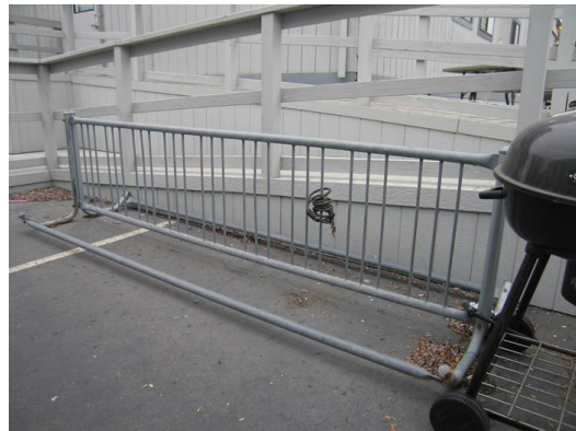
Figure 4: Example of Grid Rack