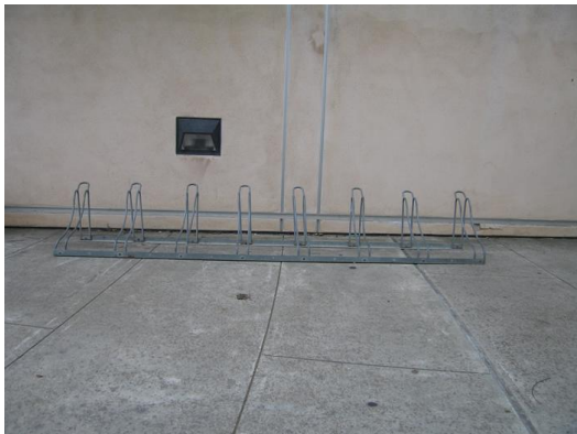
Figure 3: Example of Wheel Slot Rack